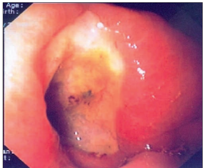
Fig. 1. Pre-pyloric ulcer with visible vessel.

A 88-year-old woman was admitted for epigastric pain and melena that had occurred in the last 15 days, and culminated in an episode of syncope with fall and head injury. She had a history of ulcers and had taken nonsteroidal anti-inflammatory drugs (NSAIDs) intermittently for arthralgias. Blood pressure and pulse rate were within normal range, and once cranioencephalic CT excluded major lesions, an upper gastrointestinal endoscopy was performed. It revealed a large ulcer in the lesser curvature of the pre-pyloric antrum with a visible vessel in its center (Fig. 1) and an opening close to the distal rim of the ulcer (Fig. 2). Exploration of this channel with a biopsy forceps (Fig. 3) and, subsequently with the endoscope, revealed a tract