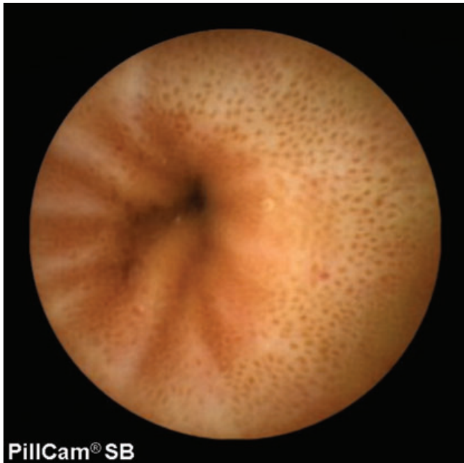
Fig. 1. Capsule endoscopic image shows a brown pigmentation with a speckled, continuous pattern in the proximal jejunum.