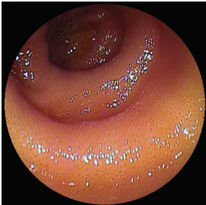
Fig. 2. Double-balloon enteroscopy revealed the same brown pigmentation with a speckled pattern in the distal ileum.

pigmentation was visible at a previous enteroscopy. In the 2 years between both retrograde DBE, the patient maintained oral iron therapy and histological study of biopsy specimens confirmed iron deposition in the lamina propria. However, as reported in other cases, we found no clear mechanisms for pigment deposition. Coupling of absorbed iron with a sulfur moiety from antihypertensive medications could be a hypothesis for pigment accumulation in the macrophages of the lamina propria. 5