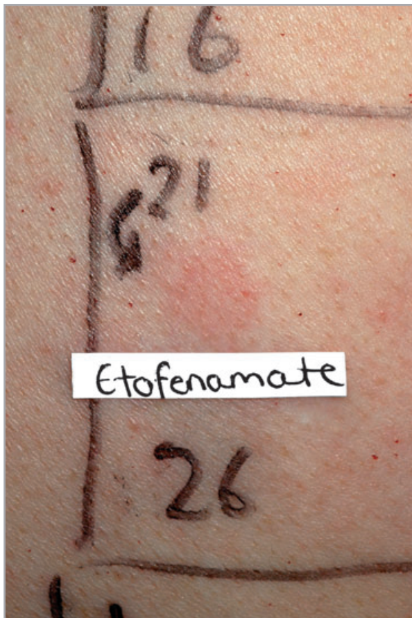
Fig 2. Close-up of etofenamate reaction at 24 h post irradiation in irradiated set, displaying '+' International Contact Dermatitis Research Group grade reaction.

The UV absorbers most commonly leading to PACD were octocrylene and benzophenone-3. As discussed above, many subjects may have developed cross-reactions to ketoprofen. However, they appear to have an inherent photoallergenic po-