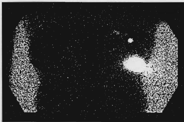
Fig. 1. Lymphocintigraphy.

nancy through previous biopsy, from November 1999 to January 2002. Pregnant women, patients with palpable axillary nodes, multifocal cancer or who had previously undergone chemotherapy, radiotherapy or surgery and patients with allergy to the radiopharmaceutical or the blue dye, were excluded.