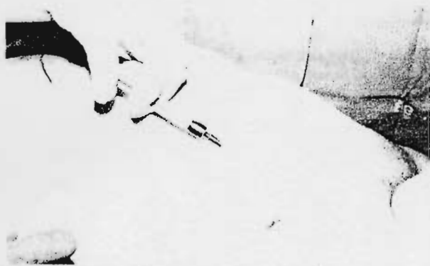
Fig. 2. Peritumoral injection of 1 cc of Blue Dye.

Of the 44 patients the lymphocintigraphy was positive in all but one who had a retroamillary carcinoma. During