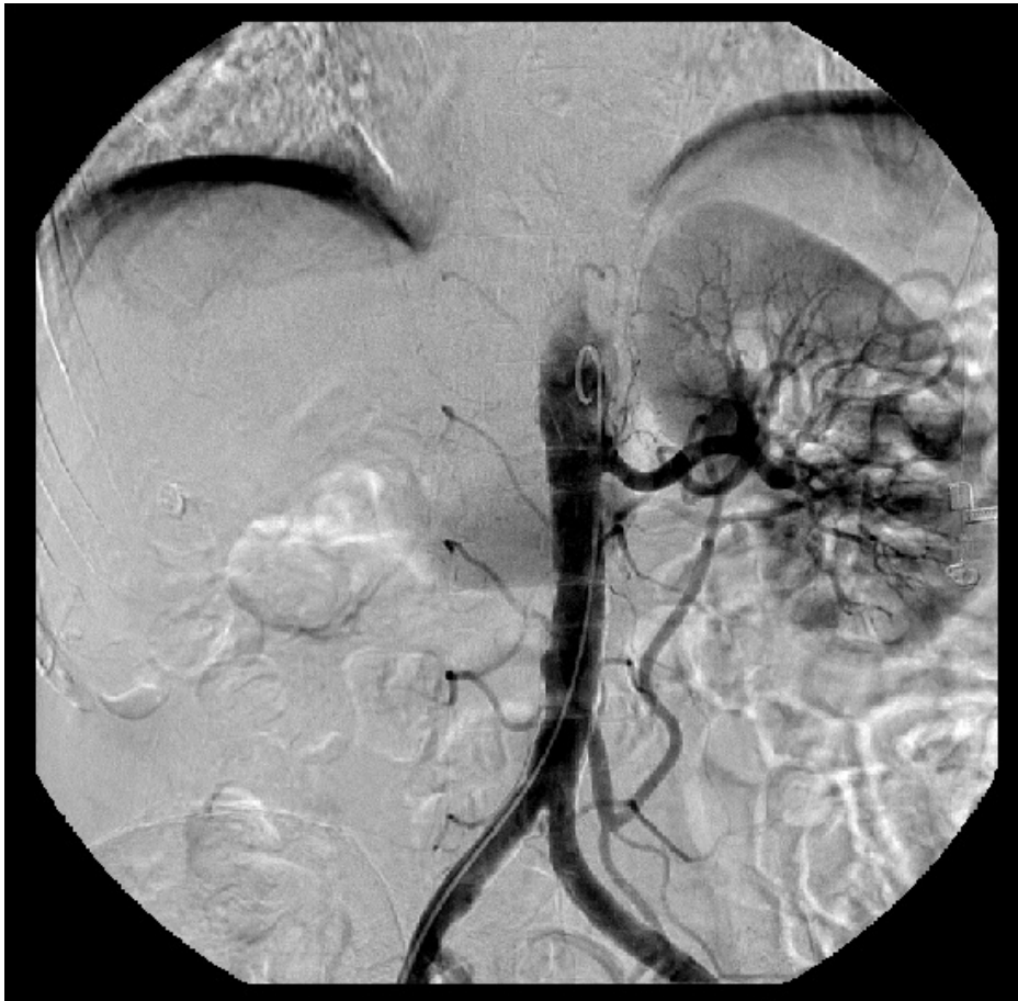
Figure 4 - Arteriography was performed, but angioplasty was not possible due to the small right vessel caliber.