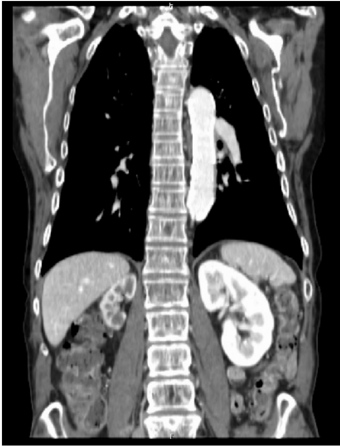
Figure 1 - Angio-CT scan revealed an atrophic right kidney with stenosis of the entire length of the right renal artery and no abnormalities on the left artery.