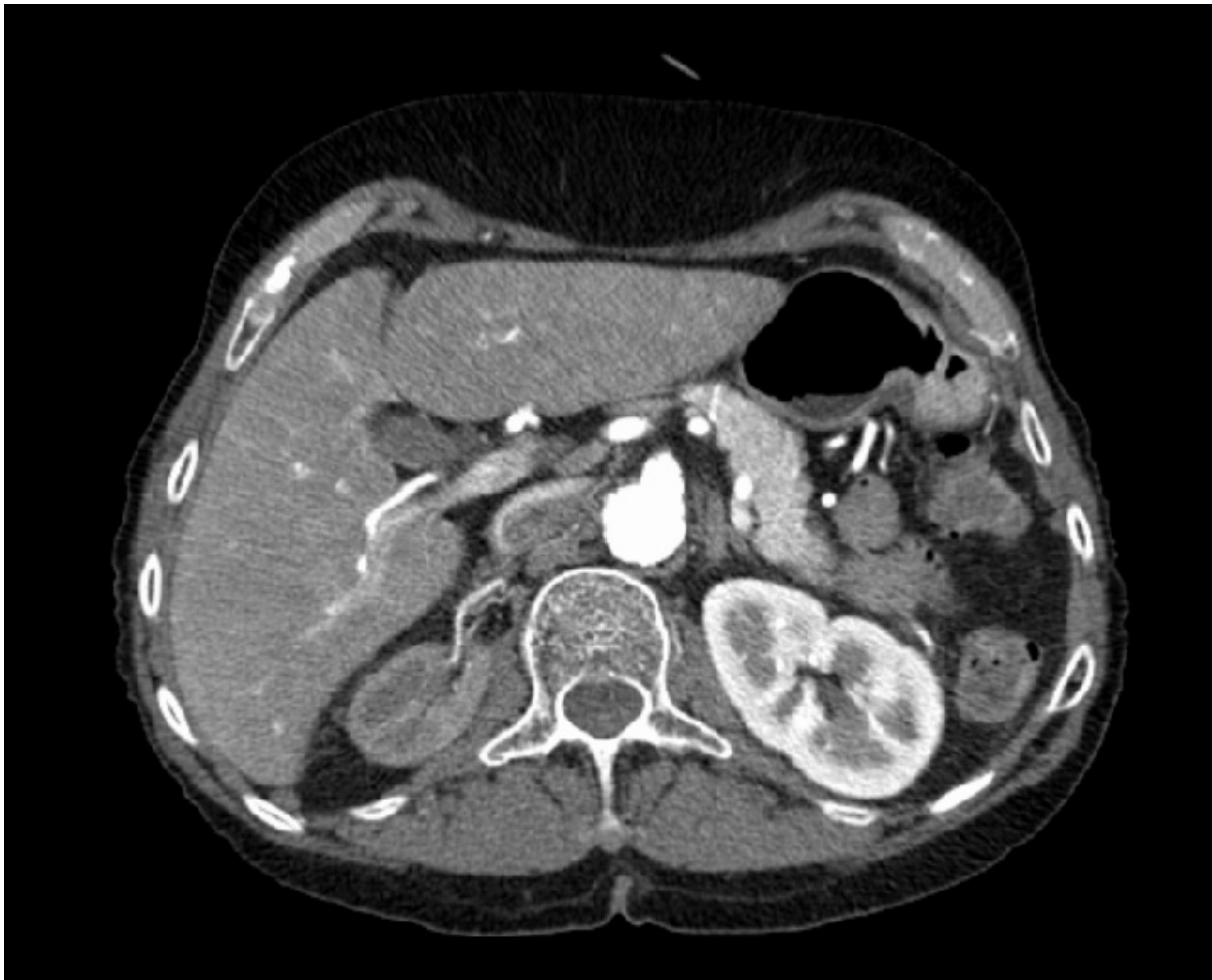
Figure 2 - Angio-CT scan revealed an atrophic right kidney with stenosis of the entire length of the right renal artery and no abnormalities on the left artery.