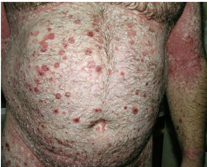
Fig. 2. Polymorphous clinical appearance of early lesions.