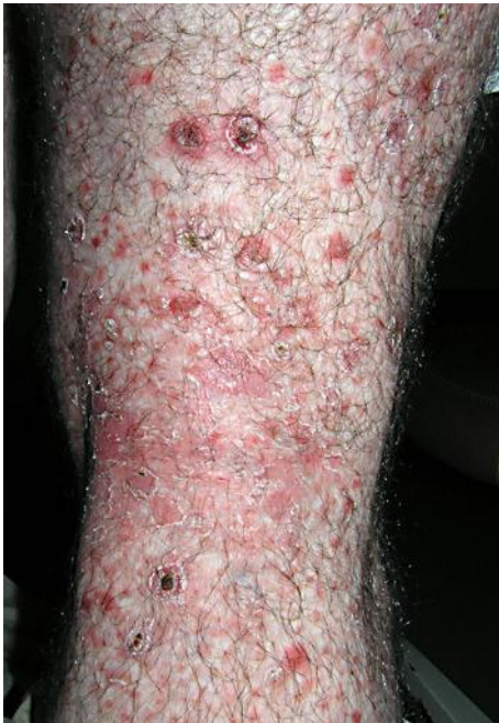
Fig. 1. Ulceronecrotic lesions with hemorrhagic crusts varying from 5 to 20 mm in diameter.