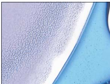
Figure 2. Photomicrograph of the explanted opacified Hydroview intraocular lens (Bausch & Lomb, Rochester, NY) showing the confluent deposits on the anterior optical surface. The polymethyl-methacrylate haptics are free of any deposits (original magnification \times 100 ).

Be sure to visit the Archives of Ophthalmology World Wide Web site ( http://www.archophthalmol.com ) and try your hand at our Clinical Challenge Interactive Quiz. We invite visitors to make a diagnosis based on selected information from a case report or other feature scheduled to be published in the following month's print edition of the ARCHIVES. The first visitor to e-mail our Web editors with the correct answer will be recognized in the print journal and on our Web site and will also receive a free copy of the book One Hundred Years of JAMA Landmark Articles .