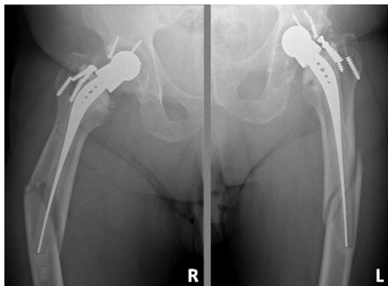
Fig. 2. Preoperative anteroposterior radiographs of the hips showing bilateral isoelastic prosthesis with osteolysis along the whole length of the femoral stem after 24 and 21 years in situ. Broken screws due to the prosthetic instability.

At 12-months follow-up, the patient presented an asymptomatic hips and expressed high degree of satisfaction with surgery result. He reported no pain in his thighs. The femoral radiograph showed consolidation of both fractures and the fibular structural allograft had no signs of bone resorption (Fig. 4). The patient was clinically able to walk without external support.