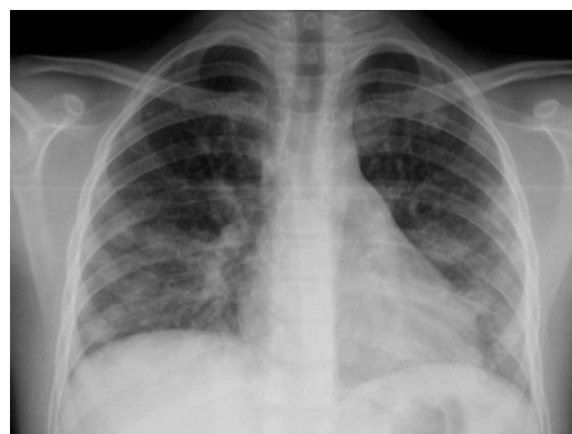
Figure 1 Chest x-ray.

On day 5 of disease he returned with additional complaints: cough and high fever. Examination remained unchanged, and despite a negative group A streptococcal rapid antigen test, a course of oral amoxicillin was prescribed. There was no improvement and he returned to the emergency room 2 days later refusing to eat, lethargic and complaining of pain in his right shoulder. He appeared acutely ill, with grunting, increased respiratory rate (up to 30/min) and transcutaneous oxygen saturation consistently >95% in room air. Examination of his throat revealed mild erythema and swelling of the oropharynx and on auscultation there was reduced air entry in both lower lung lobes. The chest x-ray showed bilateral opacities in both of these lobes, more pronounced on the right, with air bronchogram and diffuse bilateral bronchopneumonia foci without effusion (figure 1). Blood tests showed elevated white blood cell count with neutrophilia ( 13 \times 10^9/l ) and C reactive protein of 19.3 mg/dl. Serologies for Mycoplasma pneumoniae , Chlamydia pneumoniae , Epstein-Barr virus and Cytomegalovirus and blood cultures were performed. A diagnosis of pneumonia was made and he was started on intravenous ampicillin and erythromycin.